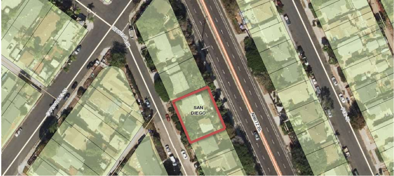
3566 Wawona Drive (between Wawona Drive and Nimitz Boulevard) APN: 449-562-0400