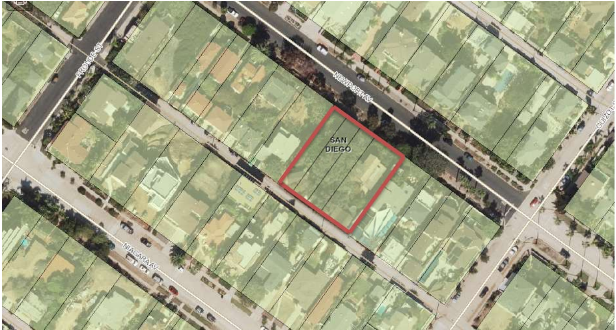
4537 Newport Avenue (between Froude Street and Guizot Street) APN: 448-652-1900, 2000, 2100, 2200