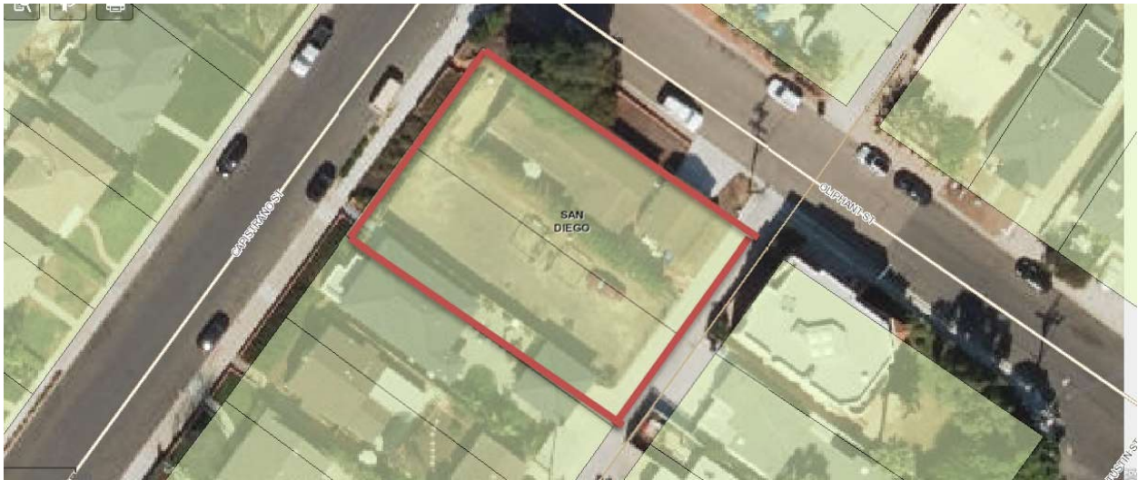
1865 Capistrano Street (between Capistrano Street and Oliphant Street) APN: 530-281-1000, 1100