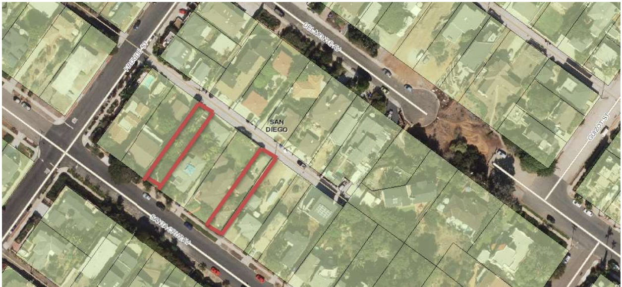
4572 Santa Cruz Avenue (between Froude Street and Guizot Street) APN: 448-641-0300, 448-641-0600